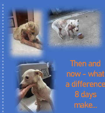
Then and now - what a difference 8 days make...